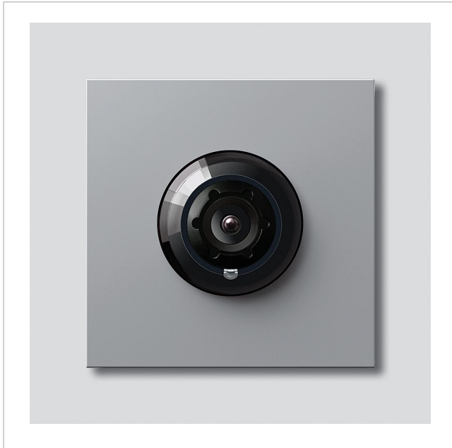
Bus camera 130 for Siedle Vario BCM 653-02 SM 200048252-02